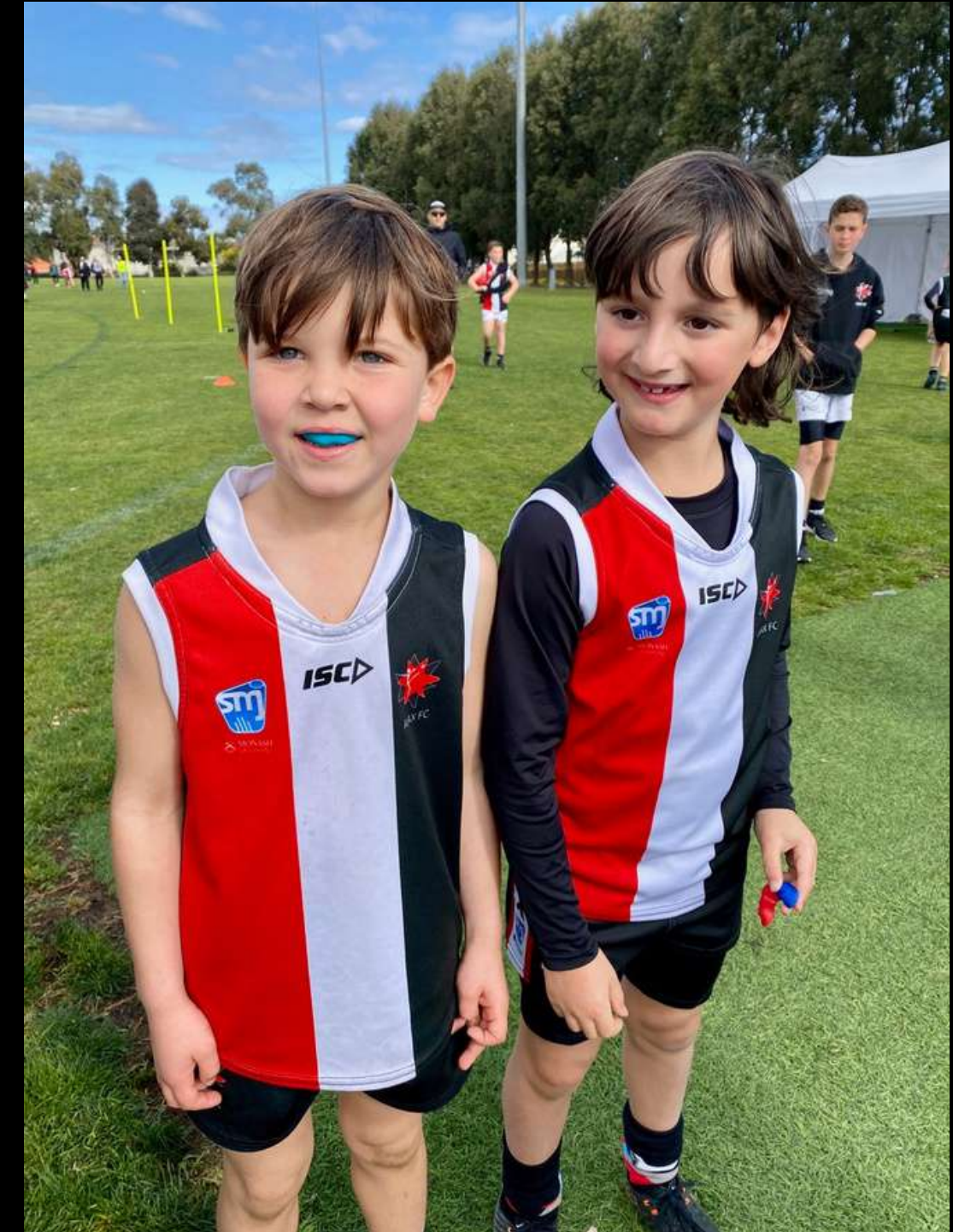
AJAX Junior Football Club Weekly Wrap - Round 14, 2023